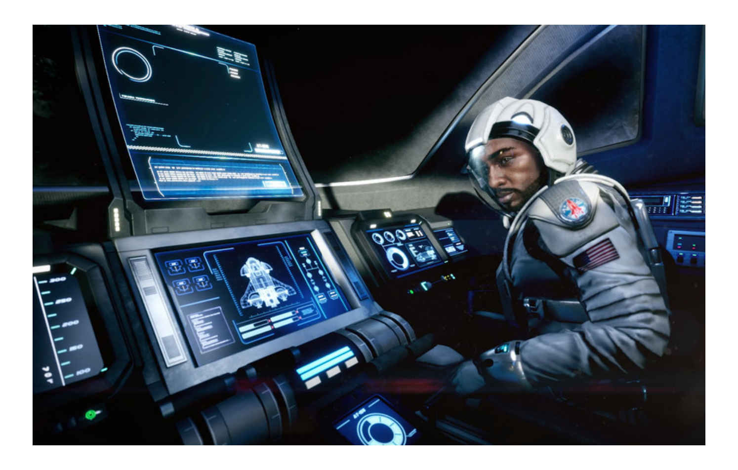
Unearthing Mars 2: The Ancient War Torrent Download [Crack Serial Key

Download ->>->> <a href="http://bit.ly/2SKbuIM">http://bit.ly/2SKbuIM</a>